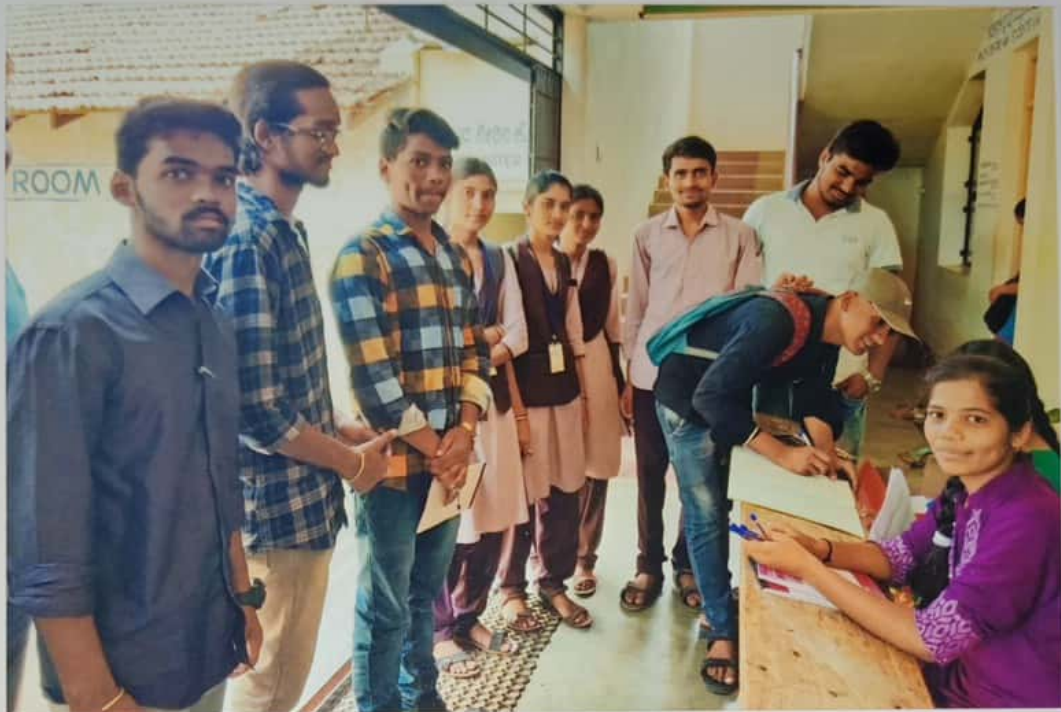
Registration of volunteers to the National Youth Parliament Festival