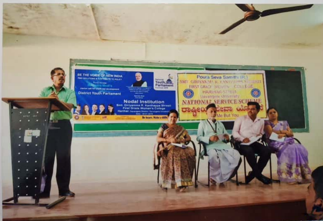
Speech of NSS officer in the Principal Smt. Giriyamma R. Kanthappa Sirasi First Grade Women's College Mysore 577601